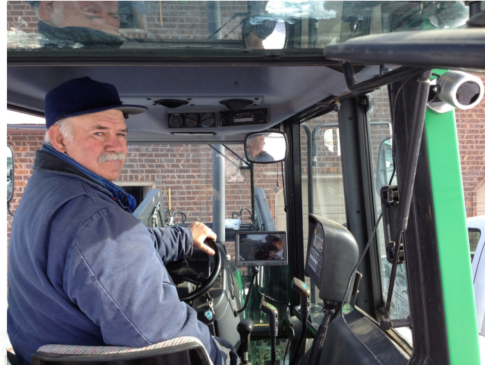
Mirrors & Cameras