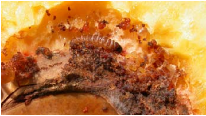
Fig. 6. Interior peach injury caused by borer feeding