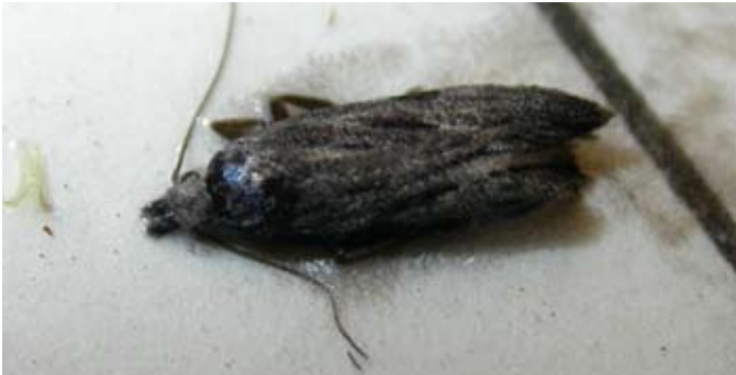
Fig. 4. Adult male peach twig borer moth