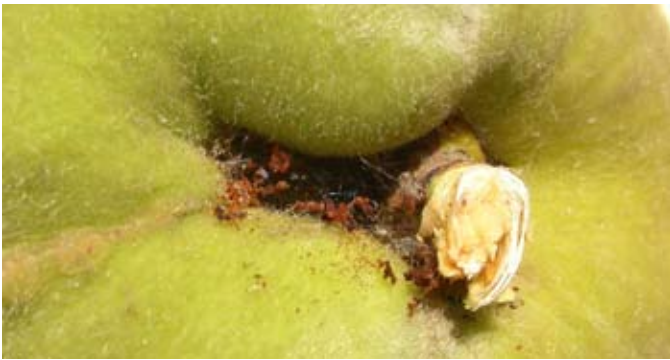
Fig. 3. Damage to fruit caused by peach twig borer larvae