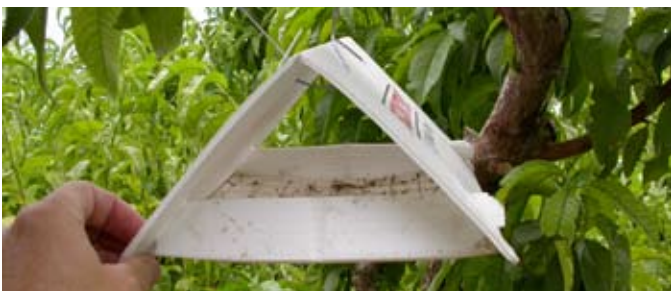
Fig. 7. Plastic delta trap with pheromone lure inside

Large delta (Fig. 7) or wing style pheromone traps are available for purchase to monitor adult activity. Sex pheromone lures are sold separately and when placed inside the traps dispense the female sex pheromone that is attractive to males only. A sticky surface inside the trap collects the moths (Fig. 4). Lures are available in a 30-day or 60-day formulation.