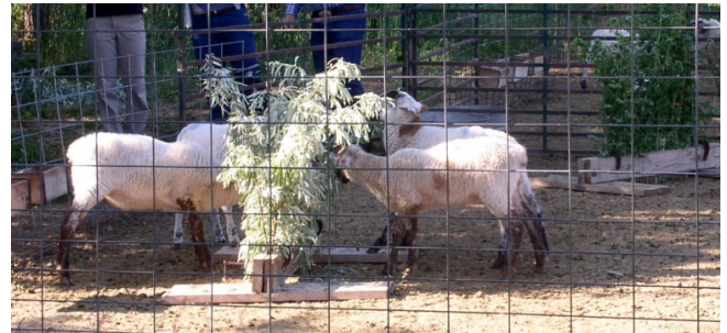
These lambs have been trained to eat Russian olive (left) and avoid Carrageena (right).

rangelands, they rarely over-ingest toxins because rapid post-ingestive feedback from toxins tells them to limit the amount of toxic food eaten. Thus, the amount of toxin in a food sets a limit on the amount of a particular food an animal can eat (Burritt and Provenza 2000). If toxin levels in a plant decline over the growing season, palatability and intake of the plant increases. That's why, when given a choice, ruminants are able to select plants that are higher in nutrients and lower in toxins than the average of the plants available on pastures or rangelands.