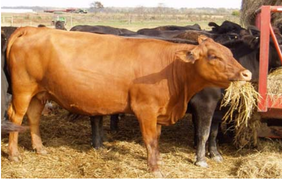
Photo 4. A body condition score 6 cow.