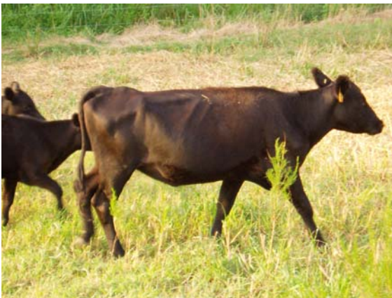
Photo 2. A body condition score 4 cow.