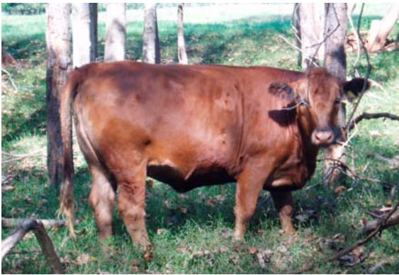
Photo 5. A body condition score 7 cow.