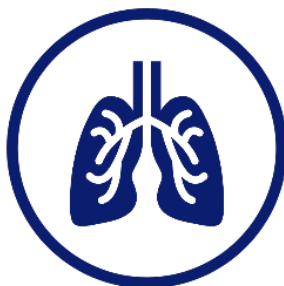
Shallow or slow breathing