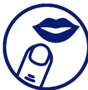
Blue/purple fingernails & lips