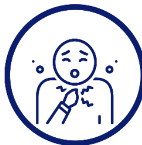
Gurgling, choking noise