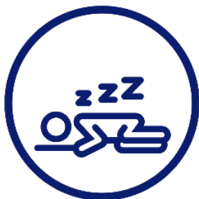
Can't be woken