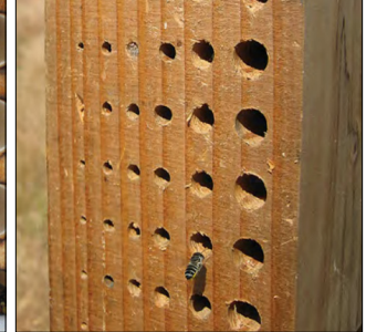
Fig. 5. Nested Wooden Grooved Trays With Liners (left) and Drilled Wooden Block (right)

goes through the back side, as bees will not nest in open-ended cavities. Avoid injuring fragile bee wings and bodies by drilling perpendicular to the wood grain, using a sharp bit at high speed, and smoothing entrances with sandpaper. Use liners in boards, blocks, and trays for a healthier bee habitat.