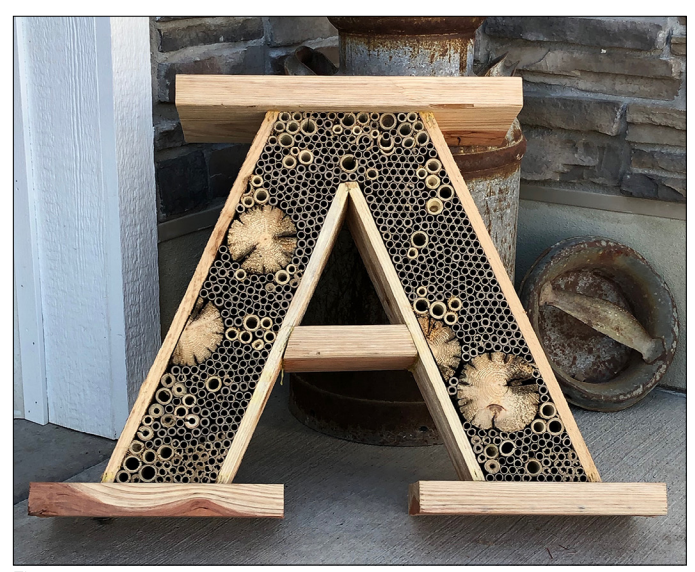
Fig. 1. Bee Hotels Can Be Creative, but All Require Regular Maintenance

ee hotels (also called "bee boxes" and "bee blocks") (Fig. 1) Dare popular additions to Utah backyards and commercial agriculture alike, adding nesting habitat to aid local pollination efforts and address native pollinator declines. Common hotel residents include various species of mason bees (predominantly Osmia) and leafcutter bees (mainly Megachile) (Fig. 2). Mason bees are among the earliest spring pollinators and include the blue orchard bee (O. lignaria), which is prized for its superior pollination of many orchard crops, while leafcutter bees are active in summer and include the commercially managed alfalfa leafcutter bee (M. rotundata) and many native species that are important crop and garden pollinators. Hotels can contain other bee species such as small carpenter bees (Ceratina), wool-carder bees (Anthidium), and resin bees (Heriades, Dianthidium). Beneficial solitary wasps (e.g., Isodontia grass-carrying wasps) that are enemies of garden pests can be additional hotel nesters. Hotels can also attract bee enemies, including parasites, predators, and pathogens, and problems can arise when these and other unwelcome guests take up residence or exploit nest resources. Fortunately, many simple