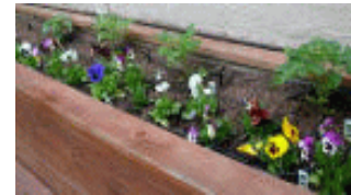
Pansies colorful in boxes and

Still another possibility is to start seed in a greenhouse in January or February. Then transfer seedlings to a coldframe in early spring, for summer blossoming. In the greenhouse, keep the night temperature about 55° F and day temperature from 60 to 65° F.