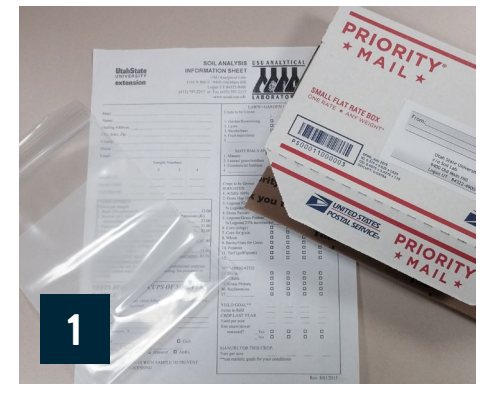
Pick up a soil sampling mailer from your local USU Extension Office or print out a form found at: usual.usu.edu/files/soilform.pdf.

The routine soil test is most common, but the lab offers several other testing options. If you have questions about additional analyses, call the lab at 435-797-2217 or contact your local county Extension office: extension.usu.edu/locations.