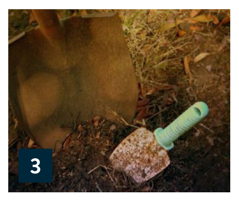
For standard topsoil, dig 12 inches deep. For turf samples, dig 6 inches deep. Samples need to be taken in several places (see form for details).