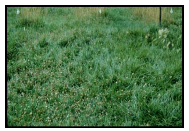
A mixed tall fescue-clover stand. Managing the stand with nitrogen or phosphorus can shift the balance to favor either the grass or legume.

Commonly available potassium sources are potassium chloride (0-0-60; 60% K<sub>2</sub>O) and potassium sulfate (0-0-50; 50% K<sub>2</sub>O). Select a potassium source based on local availability, ease of application, and cost per unit of K<sub>2</sub>O.