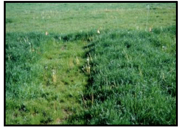
Perennial ryegrass response to nitrogen (photo taken in May). The plot on the left received no nitrogen, the plot on the right received 50 lb N/acre in April.

The seasonal distribution of forage can also be managed with nitrogen applications. Cool season grasses normally have a high rate of production in spring followed by a slowing of growth during the hot summer months. Applying large amounts of nitrogen in early spring will stimulate rapid growth and high yields. If this forage cannot be harvested for hay or grazed, consider postponing the early spring application of nitrogen or fertilizing only part of the field.