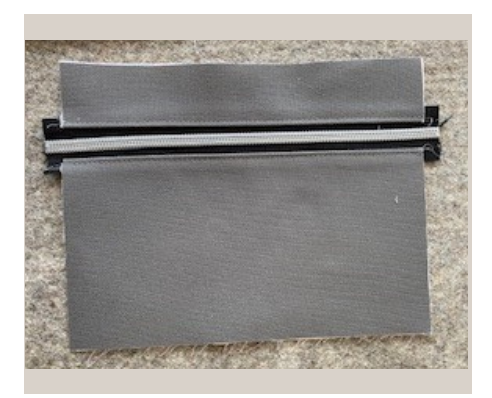
7. Press the exterior and lining fabrics away from the zipper so that bottom and top edges of both line up. Topstitch 1/8" from edge on each side of zipper. Put on the zipper pull.