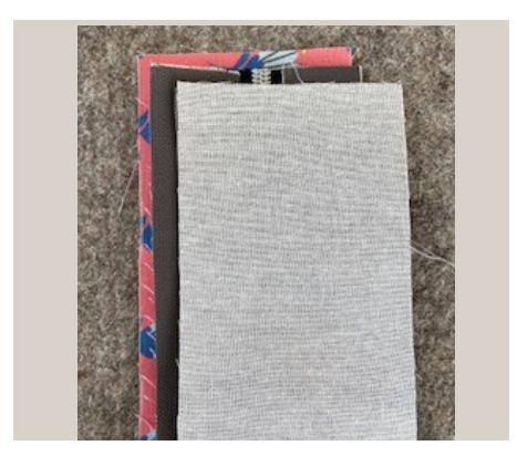
16. Place the 3" x 12" bottom gusset right sides together with the top zipper unit. Place the gusset lining right side to wrong side of top zipper unit. Sew the three layers together on the short end.