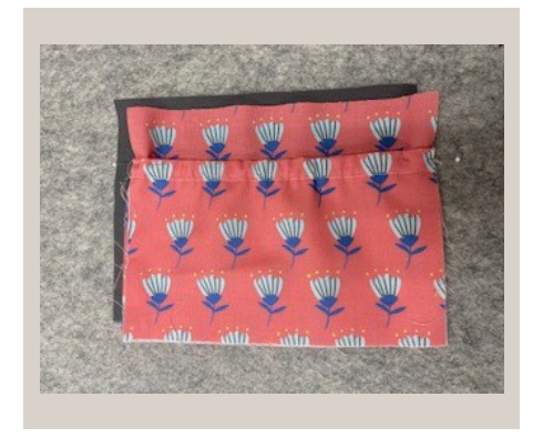
4. Place the 8" x 6" exterior fabric right side down then place the lining 8" x 6" right side up on the exterior piece. Place the pocket on the right side of lining piece (6" x 8"). Baste the layers, lining up bottom edges and corners. Set aside.