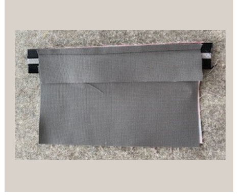
6. Press the exterior and lining bottom front away from the zipper so they are wrong sides together. Place the exterior top zipper piece 1 3/4" x 8" to the right side of zipper and use the same method as used when sewing on zipper bottom exterior and lining pieces to the zipper.

8. Repeat steps 5-7. This time using the top zipper sidepieces (1 1/2" x 12") and the 13" zipper.