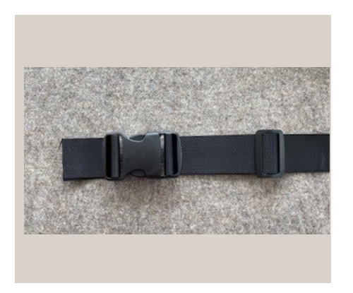
13. Loop the end of the webbing over the slide and pull through. Click the buckle pieces together.