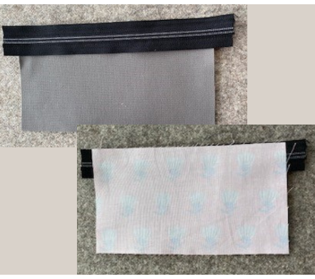
5. Center the right side of the 9" zipper onto the right side of the exterior bottom front zipper piece ( 4 \ 1/2 " x 8") along the 8" side. Baste. Place the lining piece ( 4 \ 1/2 " x 8") right sides to the exterior fabric with the zipper in between. Use a zipper foot to sew along the zipper edge using a 3/8" seam.