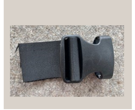
10. Cut a 5" piece from the webbing. Insert the webbing into the female side of the buckle. Fold in half and zig zag across ends.

9. The Front side of the bag contains three layers. Place the 6" x 8" lining piece right side down, then place the 6" x 8" exterior fabric right side up. Then, place the front zipper panel right side up. Baste around entire Front zipper/ front pocket facing unit.