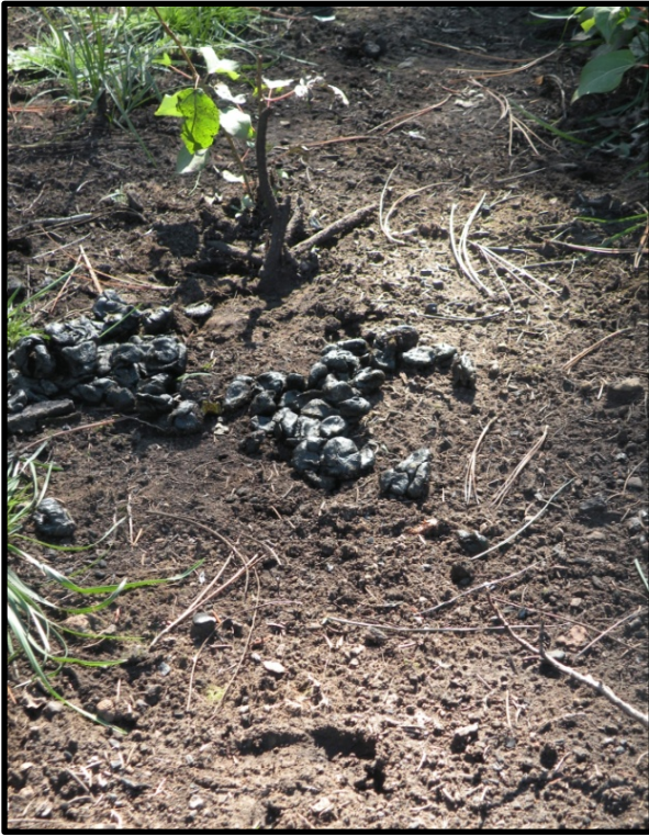
Elk scat and browsed aspen sucker following a wildfire in Arizona.

3) Aspen abundance : The density and extent of aspen also matters, with large, dense stands generally regenerating better. Whereas the fires in Yellowstone in 1988 were large and severe, there was still significant aspen and willow decline due to herbivory because there was limited browse material in this landscape to begin with. We have observed similar problems in southern Utah where patchy aspen stands regenerating after fire are browsed heavily even when ungulate populations are moderate.