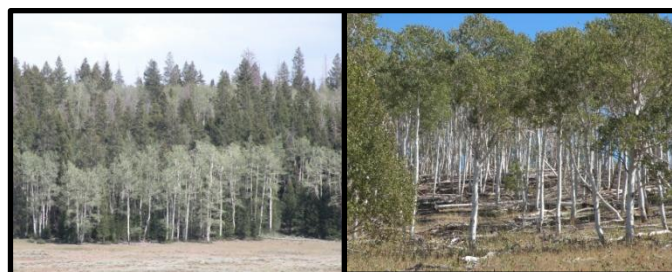
Montane seral (L) and Colorado Plateau stable (R) aspen

use. The elevated level of forest and rangeland burning during this period resulted in many of the mature aspen forests we see today (Kaye 2011).