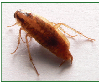
German cockroach (1/2 inch)