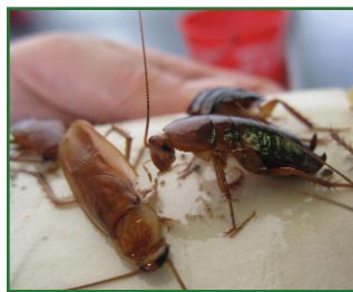
Turkestan and Oriental cockroaches (1-1.75 inches)