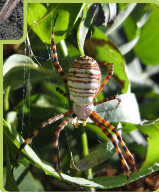
Right: Figure 2. Banded garden spider.