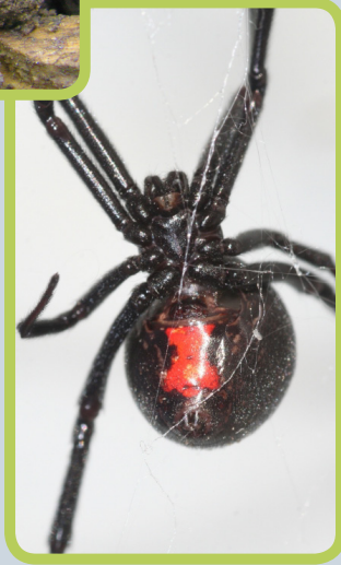
Right: Figure 4. Female black widow spider with red hourglass on the underside of the abdomen