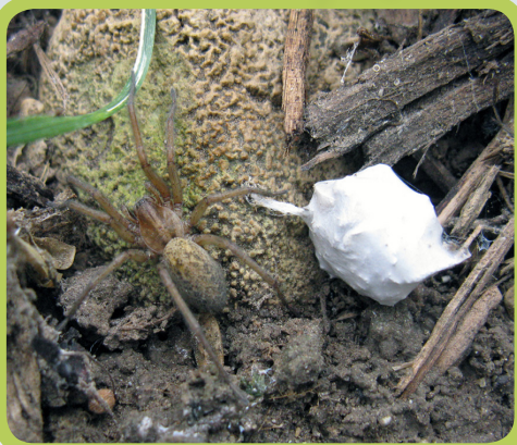
Above: Figure 1. Hobo spider female and egg sac.