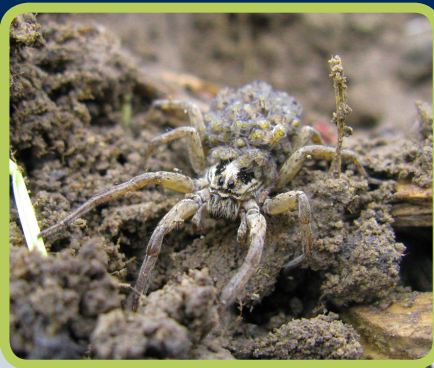
Left: Figure 3. Wolf spider with newly hatched spiderlings on her back