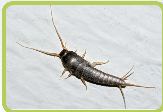
Right: Figure 2. Common silverfish