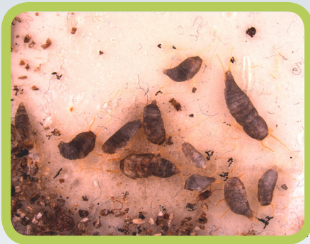
Above: Figure 1. Silverfish caught on pest monitor.