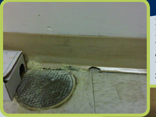
Left: Mouse hole in wall with box mouse trap on the left