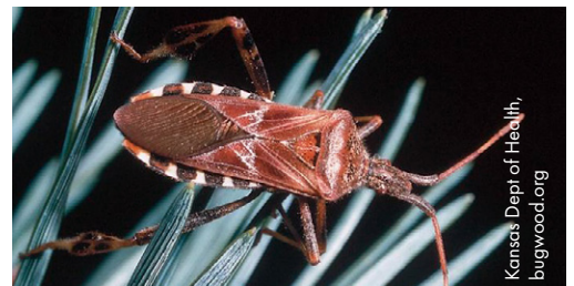
Look-alikes of the western conenose bug found in Utah: masked hunter (top), leaf-footed bug (middle), and western conifer seed bug (bottom).