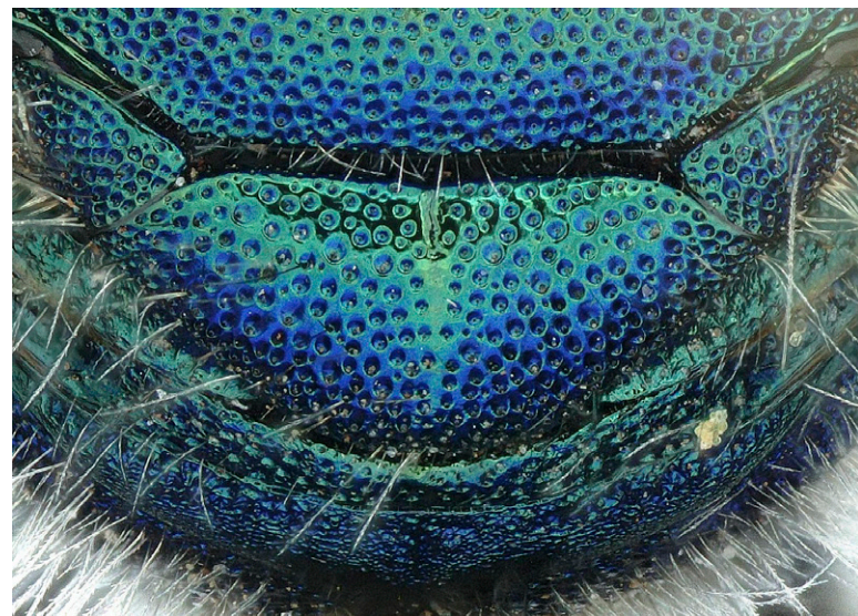
The Exotic Bee ID website includes hundreds of vivid bee images, including this one, showing the scutellum (portion of the thorax) of a female Osmia calla .