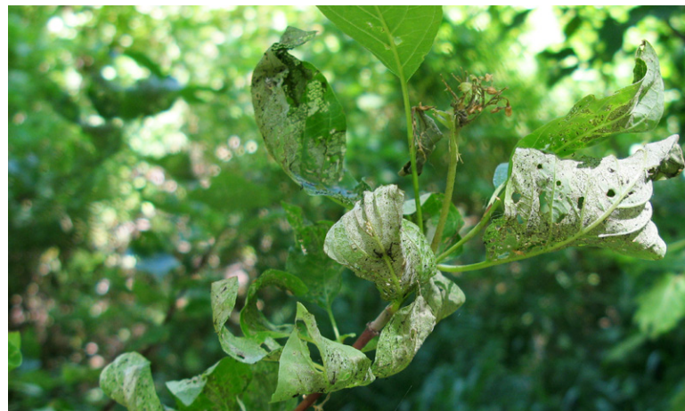
Just about anyone who grew peach, nectarine, or apricot in spring of 2018 had to deal with green peach aphids (top).

Several grasshoppers species were rampant in urban gardens, from the earliest hatch in May (middle) through September.