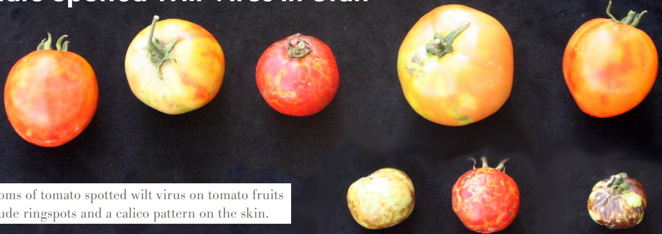
Symptoms of tomato spotted wilt virus on tomato fruits include ringspots and a calico pattern on the skin.