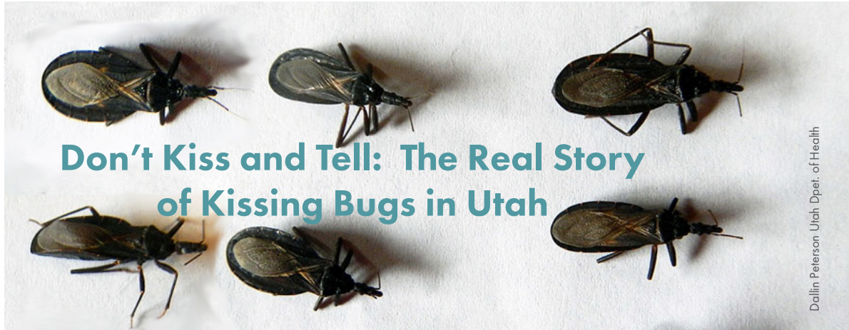
Adult western conenose bugs ( Triatoma protracta ), the species of “kissing bug” that occurs in Utah.

This August and September, the UPPDL received three samples of kissing bugs that were found feeding on people within their homes. While this is alarming, it is not new. Since 1988, the UPPDL has verified 13 cases of kissing bugs occurring in homes. In most situations, residents were being bitten. People’s concern is that kissing bugs are known vectors of Chagas disease in Latin America, and while rare in the U.S., reports of vector-transmitted Chagas are on the rise in southern states. In Utah, residents should be aware that although kissing bugs occur in some parts of the State, there is no need to panic. To date, encountering kissing bugs in Utah is rare, and the likelihood of acquiring vector-transmitted Chagas in Utah is low.