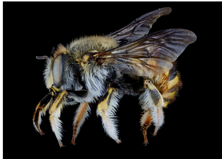
The European wool carder bee is an exotic bee that has successfully spread throughout the U.S.

Proper identification is crucial to preventing new introductions. Exotic Bee ID is a comprehensive and sophisticated new web tool to help identify both native and non-native bees. The website is a multi-year collaborative project with USDA APHIS Identification