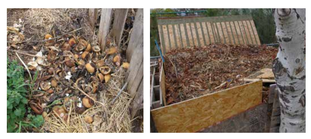
Homemade compost from kitchen scraps (left) or leaves (right) is a great amendment option that is usually abundant, weed free, and low in salts.

Plants need water, air, nutrients, and sunlight to grow. Proper soil preparation in the vegetable garden will increase plant health by facilitating gas exchange as well as water and nutrient uptake. Conversely, soils with poor structure can have drainage problems, nutrient deficiencies, and ultimately result in decreased plant health or death. A common issue in Utah is the alkalinity of garden soils. Alkaline soils cause certain micronutrients to become less available leading to nutrient deficiencies in garden plants. Iron chlorosis, for example, is a deficiency of iron available for plants and is