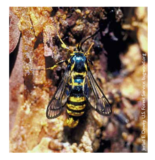
Despite its name, the clearwing moth, Sequoia pitch moth ( Synanthedon sequoiae ) feeds on a variety of pines.

The UPPDL is interested in determining which species are present in Utah. If you encounter pitch masses on pines and are able to safely remove the mass and the larva, please submit the larva to the UPPDL for identification. If the larva is not present in the pitch mass, it may be