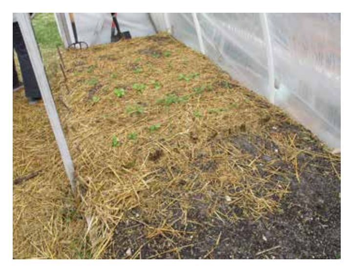
Mulches, like the straw used above, can reduce moisture loss from soil, moderate surface soil temperatures, control annual weeds and grasses, reduce compaction, and decrease runoff and soil erosion.