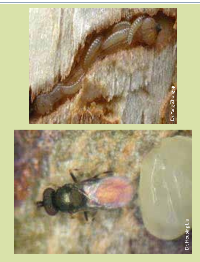
Top:Spathius agrili larvae consuming EAB hostBottom:Oobius agrili adult parasitizing EAB egg.

These parasitoid wasps will not eradicate EAB. However, they can be used in an integrated pest management plan to help control the pest and benefit our urban, suburban, and rural landscapes. Continued scientific advances in the fields of forest health, pest management, and entomology offer promise that more effective treatments and tools will eventually be available to fight EAB.