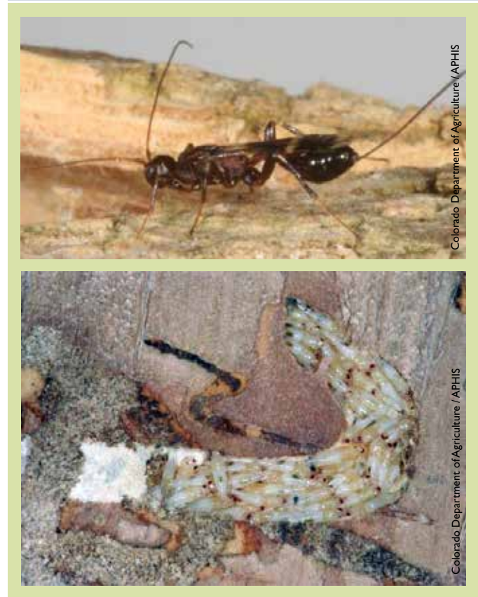
Top : Female Tetrastichus wasps have a long ovipositor to drill into trees and lay eggs on emerald ash borer larvae.

Following host range and specificity testing, USDA prepared an environmental assessment that outlined the risks and benefits of releasing the wasps. With approval from the State of Michigan, USDA began to release the wasps in July 2007. The USDA APHIS PPQ Biological Control Production Facility in Brighton, MI became operational in January 2009. It was designed to produce the EAB parasitoids for field release. Over 720,000 individual wasps have now been released in 19 States: Colorado, Connecticut, Illinois, Indiana, Kentucky, Maryland, Massachusetts, Michigan, Minnesota, Missouri, New Hampshire, New York, North Carolina, Ohio, Pennsylvania, Tennessee, Virginia, West Virginia, and Wisconsin.