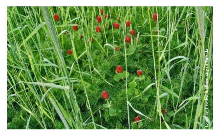
Polyculture of crimson clover, cereal rye and hairy vetch used as a green manure cover crop for sweet corn.

WEEDS. Of all the pest groups, CCs can have the largest impact on suppressing weeds. CCs reduce weeds through