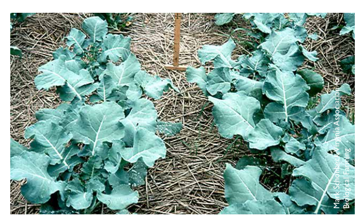
A rye-vetch cover crop was mowed down to suppress weed competition during broccoli seedling establishment.

Alternate rows of sunn hemp ( Crotalaria juncea ) were cut and tilled into the soil to suppress plant parasitic nematodes before planting cucumber seedlings between rows. Remaining rows of sunn hemp continue to be cut once a month and managed as a living mulch to suppress weeds.