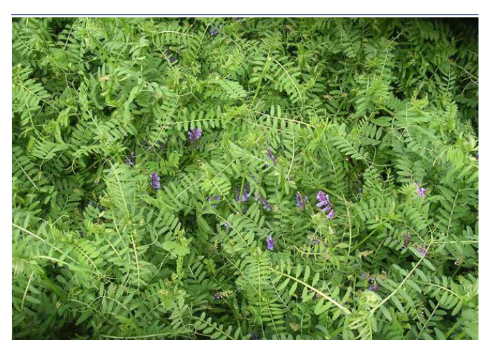
Hairy vetch, shown here in early May, is a winter-hardy, annual legume. It is said to be more efficient at nitrogen fixation than peas.

creates its own scheduling problem if the land is occupied by other crops. Fast growing CC's like buckwheat or millet (both like hot weather) can be planted in mid-summer after an early cash crop to help control weeds, re-cycle residual soil nutrients, or add more organic matter back into the soil. Sometimes finding the right niche in which to use a CC is difficult.