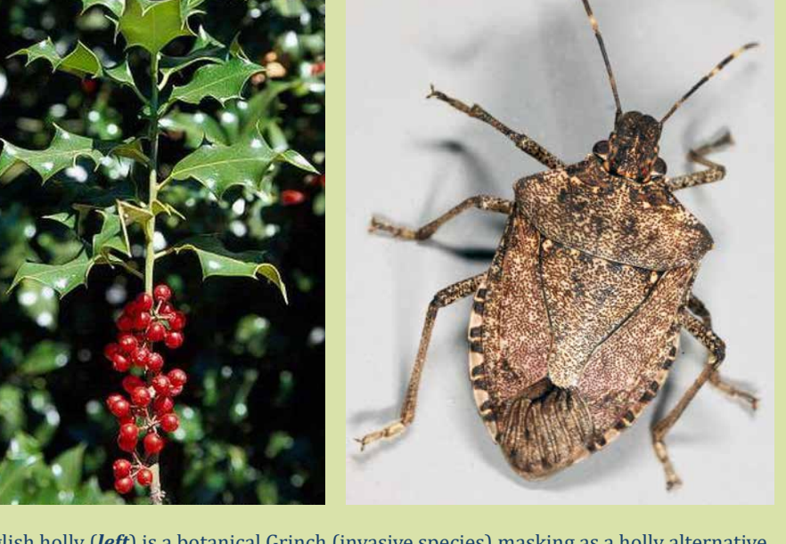
English holly ( left ) is a botanical Grinch (invasive species) masking as a holly alternative. BMSB adults ( right ) are shield-shaped, 5/8-inch long, and mottled brown. They have a smooth edge along their pronotum ("shoulders"), rounded shoulder tips, and alternating dark and light bands on their antennae and along their abdominal edges.

This season, also be on the lookout for invasive plant species that are commonly used in holiday displays and avoid decorating with them. For example, invasive plants such as Oriental bittersweet ( Celastrus orbiculatus ), multiflora rose ( Rosa multiflora ), and English holly ( llex aquifolium ) have attractive qualities, but are known to invade and disrupt native habitats, and are difficult to control. These plants are also