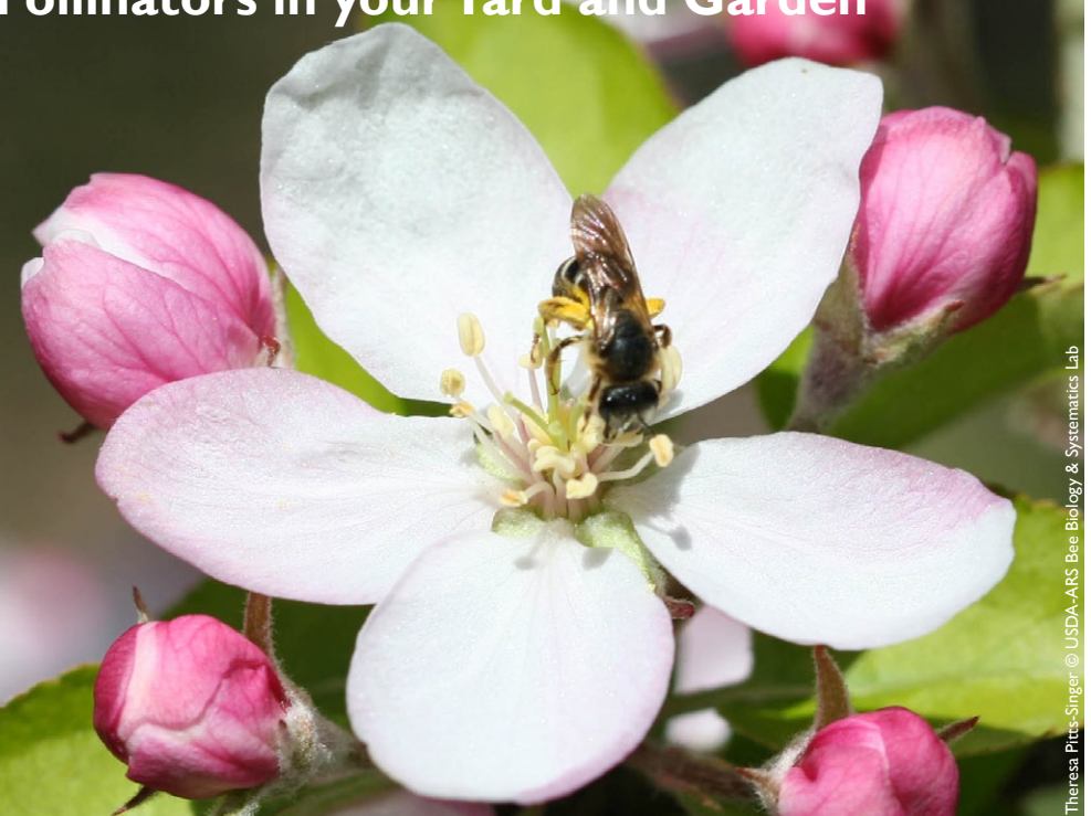
Figure 1 . Many species of sweat bees, such as the one shown here foraging on apple blossoms, are native to Utah.

In addition to food, pollinators also have other requirements, such as shelter and nest materials. Trees, bushes, and other vegetation can provide butterflies, moths, and hummingbirds with protected areas for perching, nesting, and hibernation. Trees can also meet other habitat requirements; for example, hummingbirds often collect nest materials from willow trees. Pollinators need both sun and shade. Often they will bask in