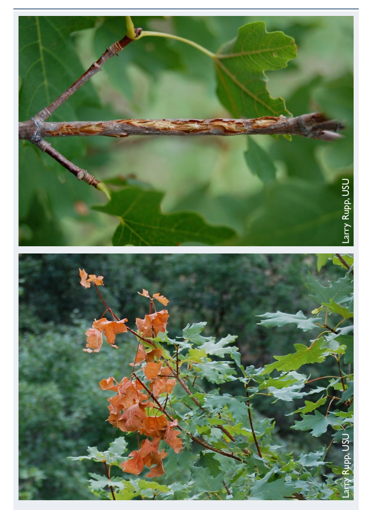
Figure 2 . Ovipositor damage from cicada on canyon maple (left) with subsequent flagging (right). Flagging is the result of cicadas laying eggs inside small terminal branches; these branches eventually die and break off.

Finally, native plant species have varying degrees of susceptibility to pesticides, and show phytotoxicity to chemicals that are not a problem for more common horticultural varieties. Unless cultivated varieties are available, most native plant species have not been tested for potential toxicity to pesticides. For this reason, we recommend cautious use of pesticides on