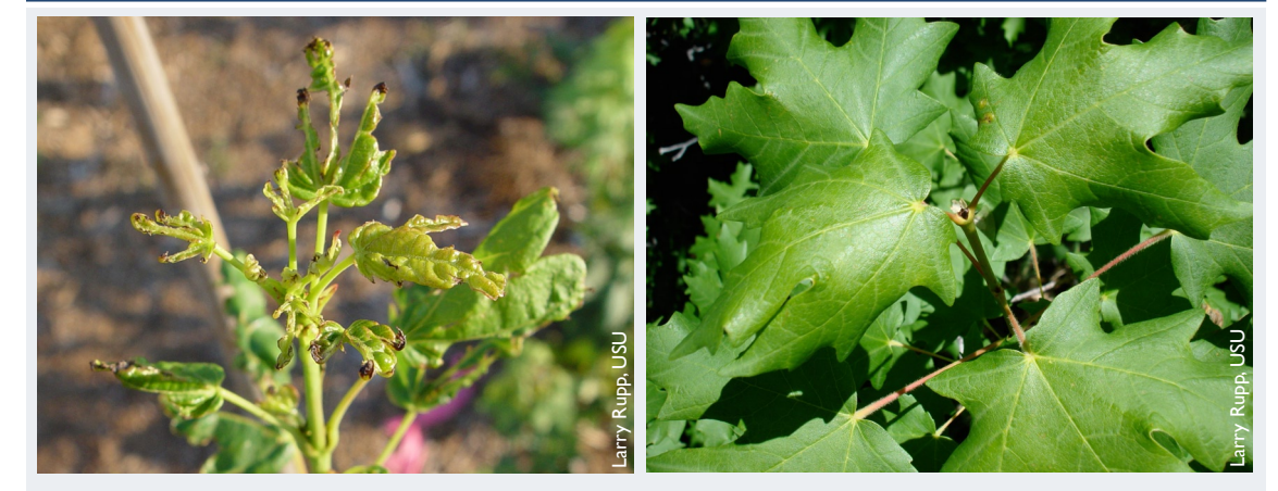
Figure 1 . Terminal growth of nursery-grown canyon maple on July 22 (left) and typical wild maple on June 9 (right). Note difference in terminal bud set and the presence of leaf tatter on the nursery-grown plant.

Demand for ornamental plant species native to the Intermountain West is expanding rapidly. People desire plants native to their region for their ability to attract native pollinators and other wildlife to their yard, to conserve water, and for their unique charm and beauty. Purchasing native plants supports growers who produce these plants for their ornamental value or