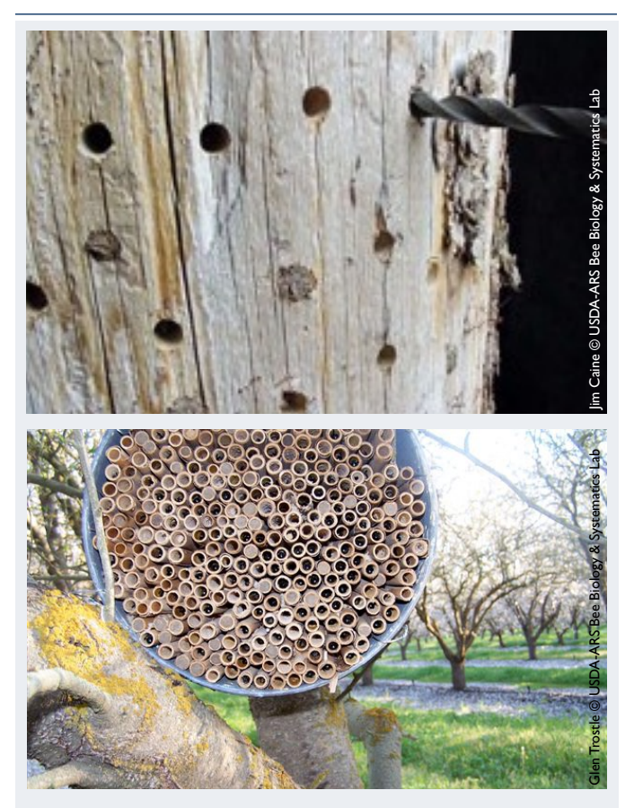
Figure 2 (top) . A log with holes drilled into it provides nest sites for solitary bees. In this photo (top), the mud-covered holes are completed bee nests.

Figure 3 (bottom) . Empty reeds have been bundled together and placed in a plastic container to protect them from the rain. Bees are actively nesting in many of the reeds.