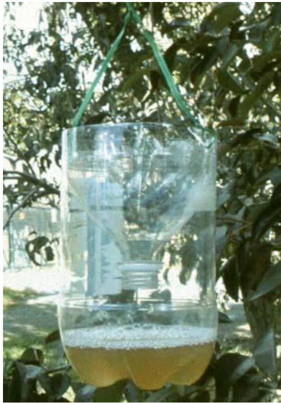
Do-it-yourself wasp traps must be designed for the right type of wasp. Yellow jackets are attracted to meat, and European paper wasps are attracted to fermenting fruit.

The yellow jacket, shown at right, has a broad “waist” and more yellow than black color on its lower body (abdomen). It commonly builds its paper nests in the ground or under dense vegetation. Yellow jackets are primarily attracted to meat baits. A simple trap can be made by cutting the top from a plastic soda bottle and inverting it (without the lid) into the bottom “cup.” Punch a hole on each side of the cup and hang the trap using wire or twine. Hang a piece of meat, such as hamburger or fish, just below the funnel-shaped top and fill the cup with water plus 1 tsp. detergent. Position the meat so that the wasp will fall into the soapy water when it attempts to fly away after cutting off a piece.