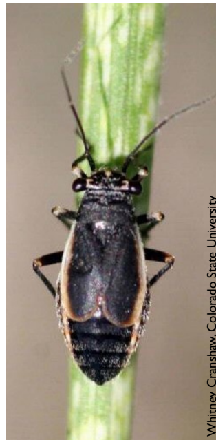
Whitney Cranshaw, Colorado State University

Black grass bugs, which are actually a complex of related insects, are not new to Utah. Favorable conditions in recent years have helped increase their populations to damaging levels in rangeland, forage, and field crops. In particular, blue bunch wheatgrass, crested wheatgrass, and intermediate wheatgrass are grass bug favorites, but wheat, barley, oats, and rye may also be affected. Once black grass bug nymphs are detected in the spring, control is limited to insecticidal sprays containing acephate, carbaryl,