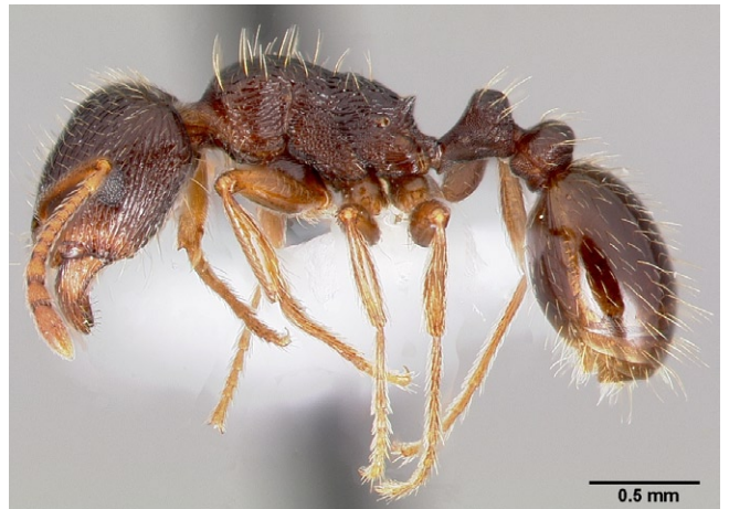
April Nobile, California Academy of Sciences

Top: Pavement ants enter into battles that can leave hundreds dead. Bottom: Lateral view of adult pavement ant. Note the spine-like projections and the double node.