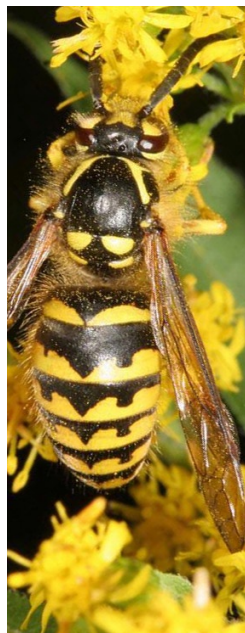
Gary Alpert, Harvard University

The European paper wasp has a narrow waist and more black than yellow on its abdomen (see image on next page). This wasp builds upside-down umbrella-shaped paper nests and attaches them to overhangs, decks, and other structures. The European paper wasp is highly attracted to decaying fruit. Landolt recommends loading the soda bottle trap previously described with a mixture of 1 part fruit juice to 10 parts water + 1 tsp. liquid detergent. The juice must begin to ferment in order to be attractive, and so it may take a day or two for rapid fermentation to begin. You can accelerate the fermentation by adding a piece of overripe fruit.