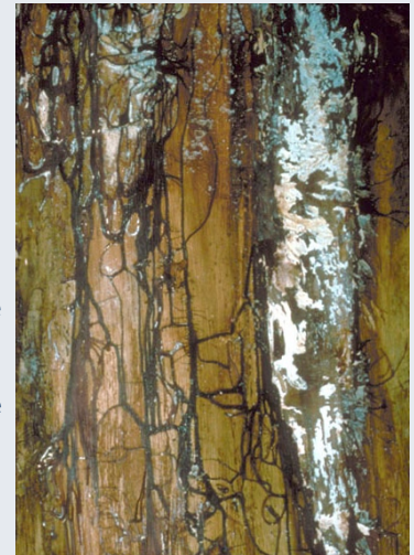
Tim Tigner, Virginia Department of Forestry

Armillaria may be more widespread in Utah than we know. Organisms of the phylum Basidiomycota will form short-lived fruiting bodies only when enough moisture is present, which isn't always the case in the arid West. Without the obvious mushrooms, armillaria cannot be identified without invasive investigation. Removing infected bark will expose a thick mat of white mycelium (shown in upper and lower image), and sometimes the black string-like rhizomorphs (shown lower), both of which are characteristic of this disease. Rhizomorphs are tightly bound hyphal structures that “explore” for food in distances of up to 10 feet. They penetrate healthy roots by a combination of mechanical pressure and enzyme action—wounds are not necessary.