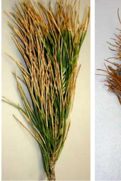
Fig. 1. Abiotic symptoms occur in uniform patterns. Symptoms of varying causes can be similar, so it's important to give a detailed history of the site.

Water stress is caused by either a shortage or an excess of water. Spruce trees are shallow-rooted, and native to the mid-mountain range of the Rockies where optimal water occurs. Mimicking the native environmental water-