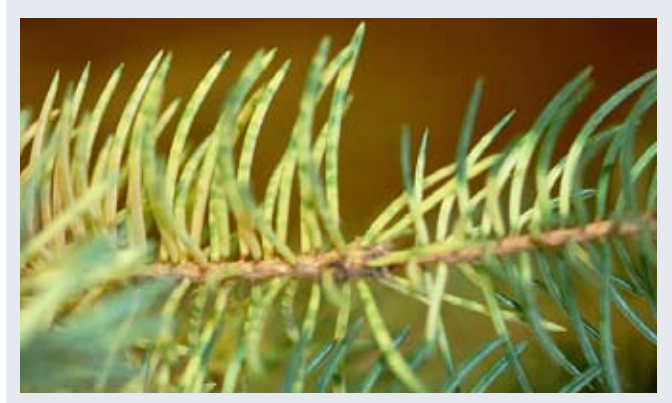
Fig. 4. Chemical damage is the suspect cause of the symptoms in this spruce, causing chlorophyll disruption.

Fig. 3. The abnormal growth of the new needles in this sample is indicative of a symptom seen with chemical damage.