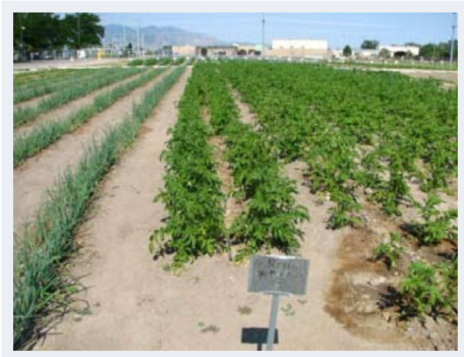
The 3-acre Salt Lake County Jail garden is fully organic.

By managing the garden naturally, without chemical fertilizers or pesticides, we meet consumers' increased desire for local, organically grown produce as well as create a sustainable garden that is relatively inexpensive to maintain,