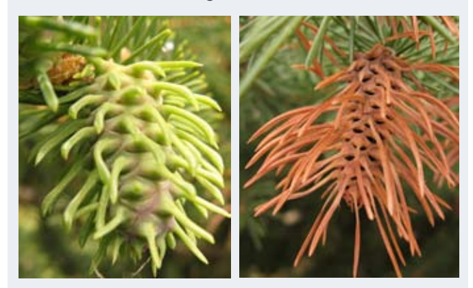
Fig. 2. An active gall (I) and a dried gall showing cracks where adults have emerged (r).

Fig. 1. The feeding of immature cooley spruce gall adelgids at the base of needles causes galls to form.