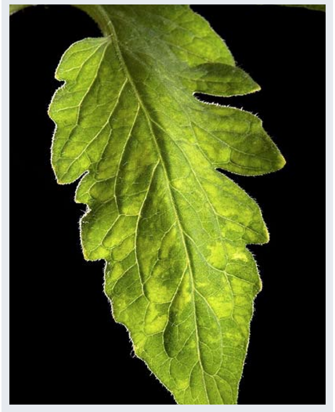
Mottled yellowing on a leaf infected with pepino mosaic virus.

Look for these tomato symptoms and report suspects to the UPPDL