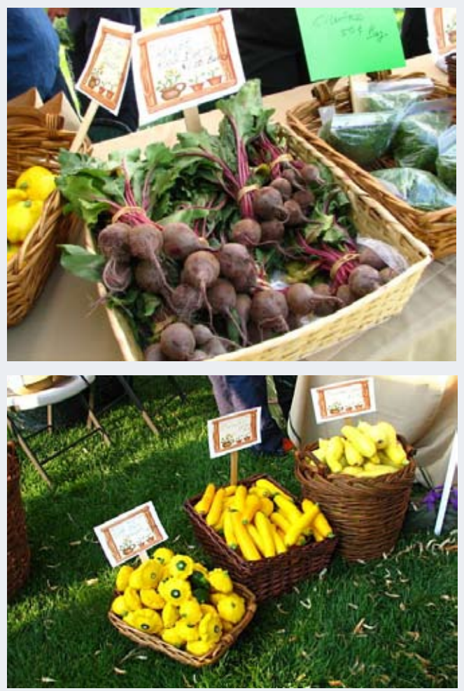
Some of the bounty from the SLC Jail garden: 'Detroit' red beets (top) and a variety of squashes (bottom).

We are hopeful and looking forward to another productive year. The biggest hope for all of us involved in the program is that, from the support of Salt Lake County Sheriff's department, education through USU Extension Salt Lake County, positive reinforcement from Master Gardener volunteers, and continued support from the community who purchased the produce, those prisoners who have gone through the garden have a chance to turn their lives around.