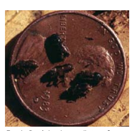
Fig. 4. Don't let the small size of ips bark beetles fool you; they are voracious feeders.

In the landscape, ips bark beetles (also known as engraver beetles) commonly attack spruce trees. Ips species are small, brown/black beetles (Fig. 4) that emerge from trees in late April or May, seek a new host tree, and bore beneath the bark where they mate, construct parent