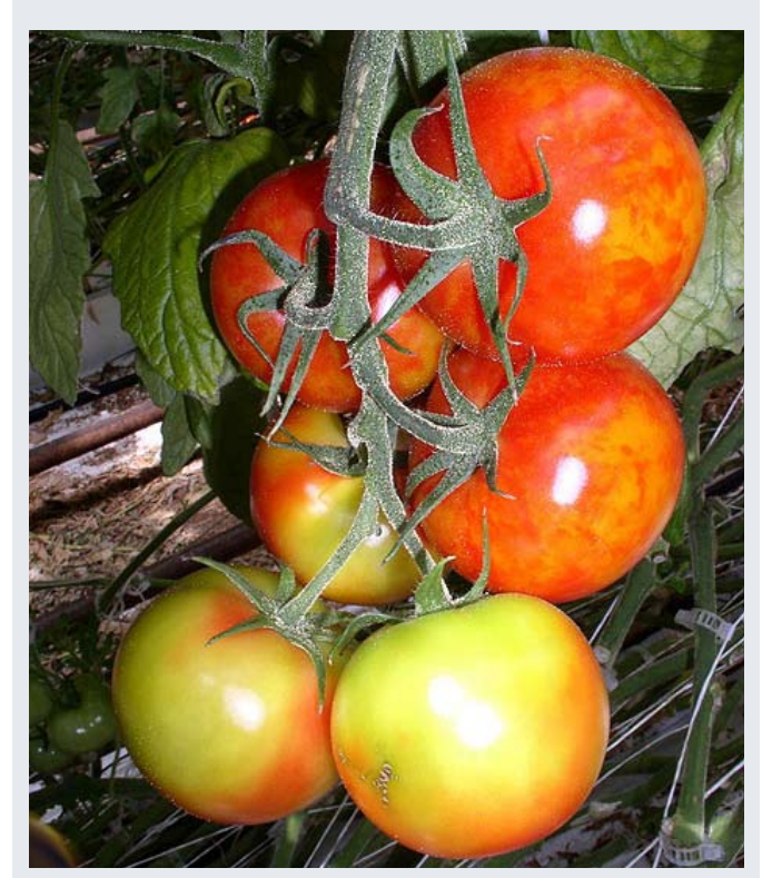
Infected fruit shows irregular ripening and a mottled pattern.