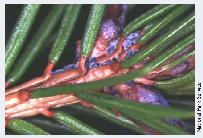
Fig. 1. The feeding of immature cooley spruce gall adelgids at the base of needles causes galls to form.

Spruce mites are a cool season mite. They cause most of their damage in spring and fall, so it is vital to scout for this pest in late winter to early spring. When the temperatures become too hot in the summer their activity slows drastically, but resumes again in the cooler fall months. Damage from