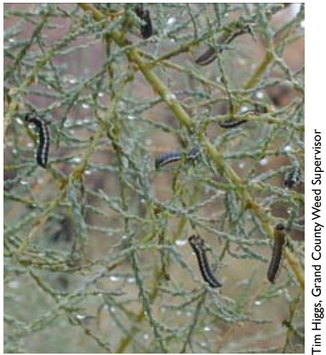
Tamarisk leaf beetles are voracious feeders and offer hope to reclaiming invaded riparian areas.

Worries that the beetle will kill native vegetation are unfounded. USDA-ARS scientists found that although larvae did feed on plants in the genus Frankenia (seaheath), they preferred feeding and