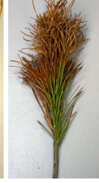
Fig. 2. Salts accumulate at the tips of the needles and progress toward the base. Soil analysis from this site showed high levels of salt.

Too much water can also cause problems in spruce, which are more sensitive to saturated soils than deciduous trees. Excess water stifles the roots through a reduction in available oxygen. Roots deprived of oxygen are unable to absorb water and nutrients, and plant metabolic processes stop, growth ceases, and trees begin to decline or die. Excess water can also predispose trees to root rot caused by Phytophthora and Pythium , which need periodic flooding for germination and dispersal.