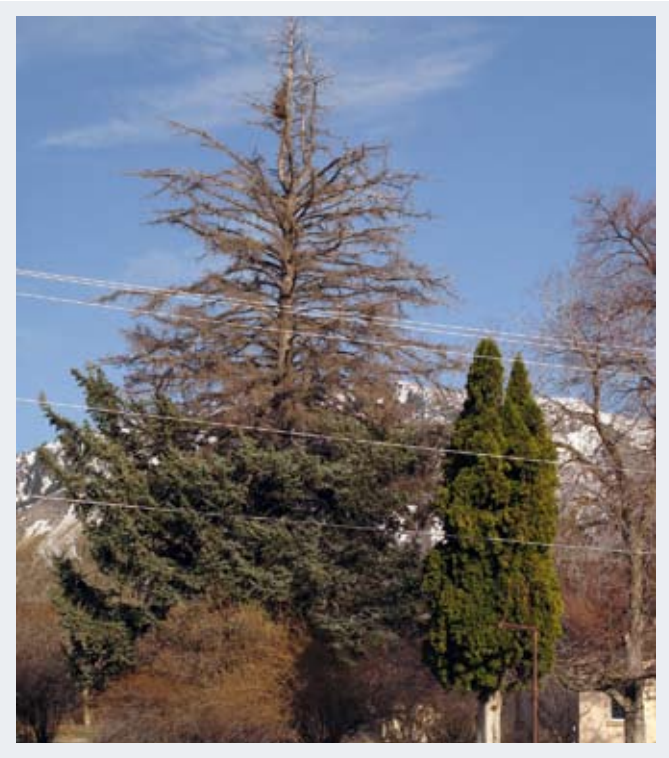
Fig. 5. Ips beetles that attack spruce often kill from the top down.