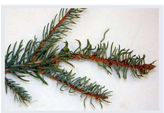
Fig. 3. The abnormal growth of the new needles in this sample is indicative of a symptom seen with chemical damage.

-Erin Frank, Plant Disease Diagnostician