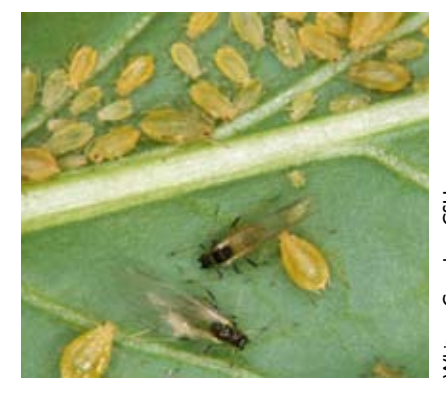
Green peach aphids are common greenhouse pests that are accidentally introduced into homes.

If a houseplant infestation does develop, there are several techniques that may help eliminate or suppress pest activity. Periodic washings of some plant types may help dislodge small insects and mites. Yellow sticky cards are attractive to most flying adult insects and can be used near infested plants. Sometimes, severely in-