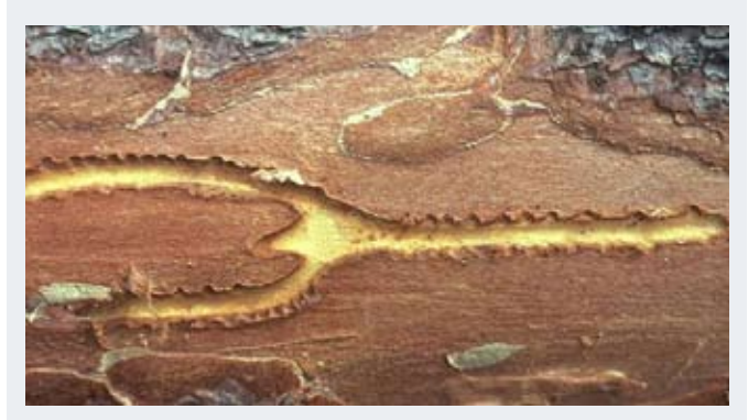
Fig. 6. Typically, galleries of ips beetles have a primary egg-laying chamber (shown above) created by the adult female. These chambers can occur in an X,Y, star, or wavy line pattern.