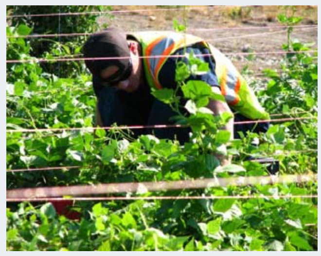
The inmates have taken ownership and pride in the garden, and work hard to keep it maintained.

environmentally safe, and encourages beneficial insects. The garden conserves water and reduces weeds through a drip tape irrigation system that applies water only to the desired plants. To manage weeds and other pests, prisoners scout the garden regularly and when needed, employ the primary control method: hand-picking. The garden also generates a lot of compost that is used for new plantings. This year we installed a hay bale compost system, with the walls of the bin created with hay bales that are easily moved when turning the compost. We also planted 150 thornless blackberry plants, 'Chester' and 'Triplecrown,' and are looking forward to harvesting them in 2009.