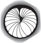
Healthy larva are c-shaped, pearly white, and plump.