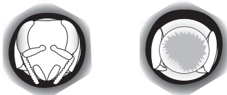
Pupa with PMS are often uncapped because the bees are attempting to interrupt the mite life cycle. After uncapping, adult bees will eat the pupal head to recover protein.