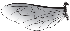
Healthy wings are smooth, fully formed, and have clearly visible veins.