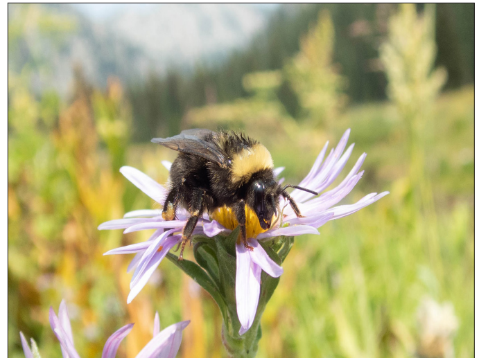
Fig. 1. Western Bumble Bee ( Bombus occidentalis ) on Aster.