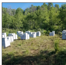
Fig. 4. Honey Bee Hives in Utah’s Wasatch-Cache National Forest.