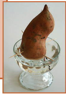
Growing a sweet potato vine.