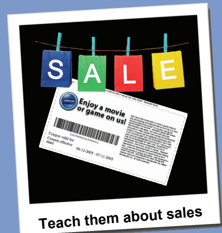
Teach them about sales