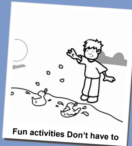
Fun activities Don't have to