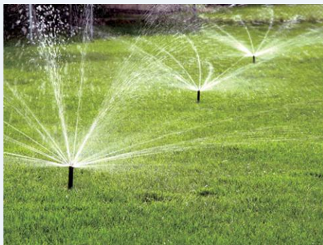
Is your sprinkler system as efficient as it could be?