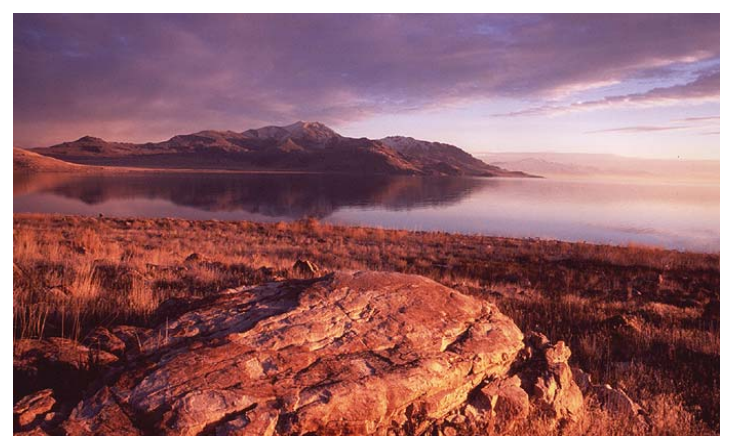
Great Salt Lake From Antelope Island State Park, Utah

There are a number of continuing and emerging tourism trends that are important to understand. One is the evolution of the importance of experience. Our society has basically transitioned to an experiencebased economy, as today's travelers are seeking new and unique "self-fulfilling" experiences. Traditional tourism activities are being augmented by adventure travel, recreation transportation (bikes, OHVs, snowmobiles, watercraft), nature tourism and eco-tourism, wildlife viewing and birdwatching, agricultural tourism, and cultural heritage tourism.