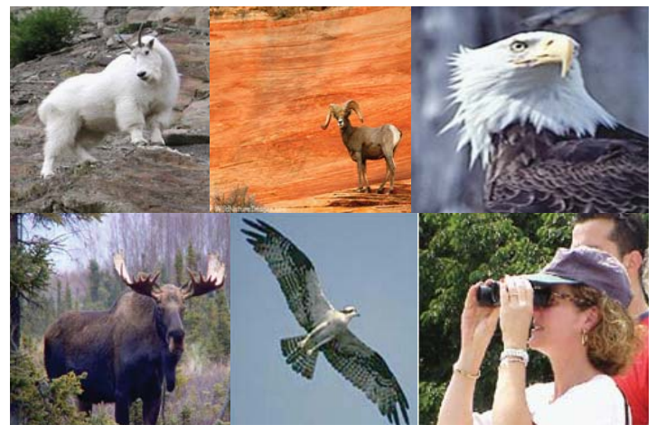
Wildlife and Birdwatching

Many rural communities have attractive amenity resources, and opportunities exist for the development of a variety of tourism-related businesses that can enhance "Destination Tourism." Today's tourists are willing to pay for quality experiences, services, and products, but there must be enough activities and places to visit. The challenge is to focus on development of compatible, dispersed tourist businesses that will help vitalize a local economy, and to develop a quality package of activities and experiences to both attract visitors and convince them to make an extended trip. Natural allies for such tourism development are outdoor recreation, nature tourism, agricultural tourism, and cultural-heritage tourism.