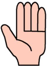
a. Your whole hand

3) We should eat a piece of chicken that is the size of _____