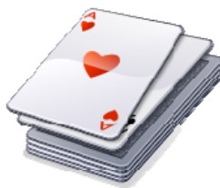
b. A deck of cards