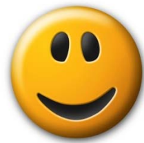
d. Your face