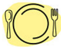
c. A dinner plate