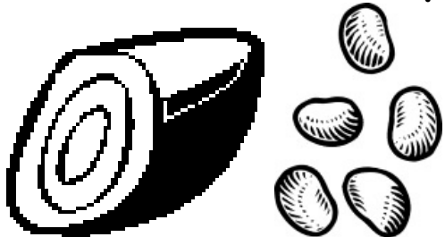
Meat and Bean Group