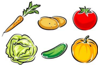
a. Colorful Vegetables

2) Which of the following is a good idea to eat for dinner?