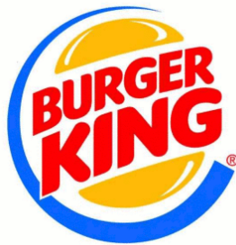
b. Eat out at restaurants