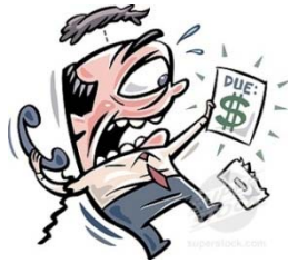
b. Lose it