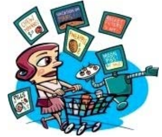
d. Buy food you didn't plan to buy

2) Which of the following is a good idea to eat for dinner?