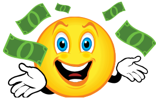
a. Spend it fast