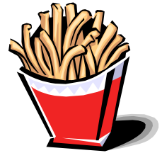
d. French Fries

3) You will usually buy less when you _____?