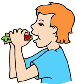
a. Eat before shopping

3) You will usually buy less when you _____?