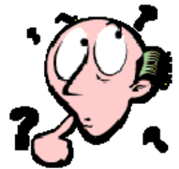
d. Forget Shopping List