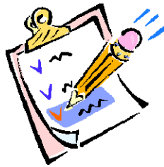
c. Plan your meals