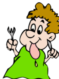
c. Go shopping hungry