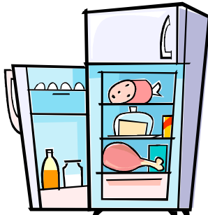
a. Keep cold foods cold

3) Which is a dangerous way to keep food?