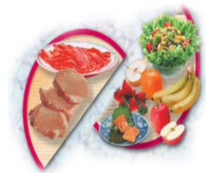
d. Separate raw from cooked food