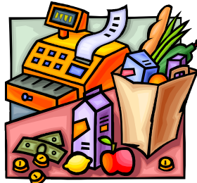
b. Pay for all your groceries