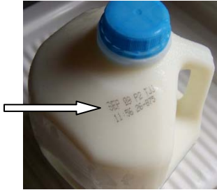
a. Check expiration dates

2) What is one thing you should you do when you go grocery shopping to make sure your food is safe?