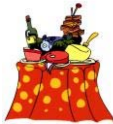
b. Let food sit on table all day