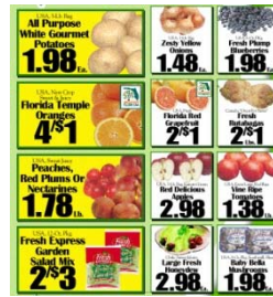
d. Check the ads before going