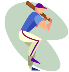
d. Play Baseball

2) What is one thing you should you do when you go grocery shopping to make sure your food is safe?