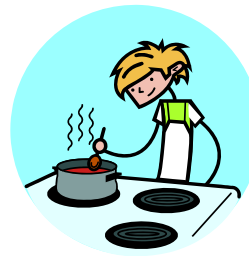
c. Keep hot foods hot