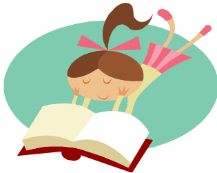
b. Read a book