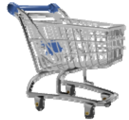
d. Get a shopping cart

3) Which is a dangerous way to keep food?