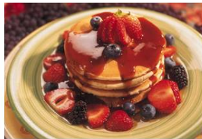
Berries with pancakes