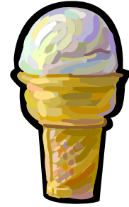
d. Ice Cream

2) What is a healthy drink to have for breakfast?