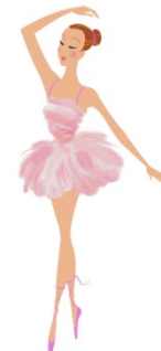
d. A Ballerina