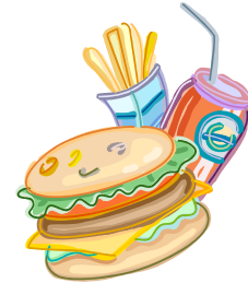
d. Hamburger, fries and soda