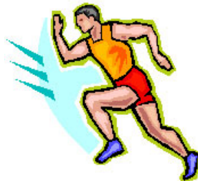
c. Have Energy