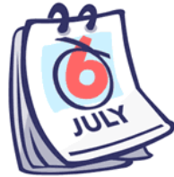
b. Every day