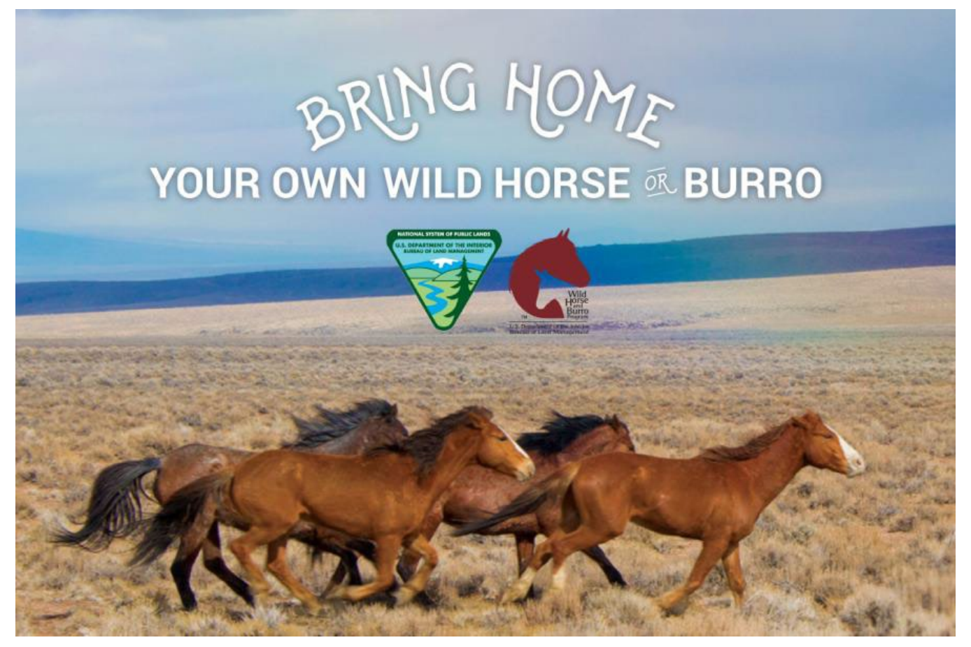
BLM ADOPTION AND SALES EVENTS

https://www.blm.gov/programs/wild-horse-and-burro/adoption-and-sales/events