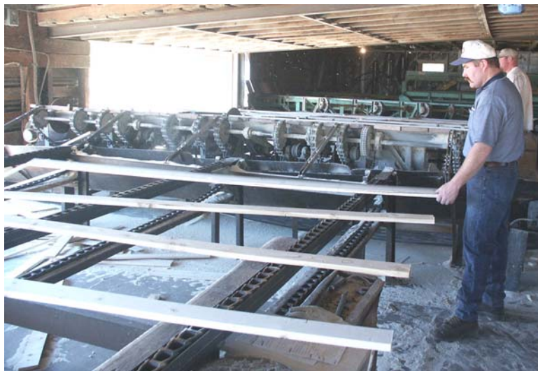
Family employees sort lumber at the Blazzard Sawmill in Kamas.

A serious concern echoed by several private forest landowners in Utah recently is our lack of markets for their logs. In the past few years' landowners have been known to ship logs to Colorado, Idaho, Oregon, and Montana to get paid for the wood removed from their property. An often asked question is: Why don't we have enough sawmills in Utah to purchase the logs produced here?