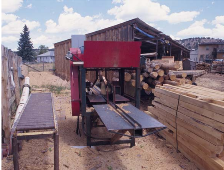
The older saws at the Fabrizio Sawmill in Hanna are being combined with new equipment and moved to a new site north of Duchesne.

stating that a continuous supply of logs is their biggest challenge to doing business.