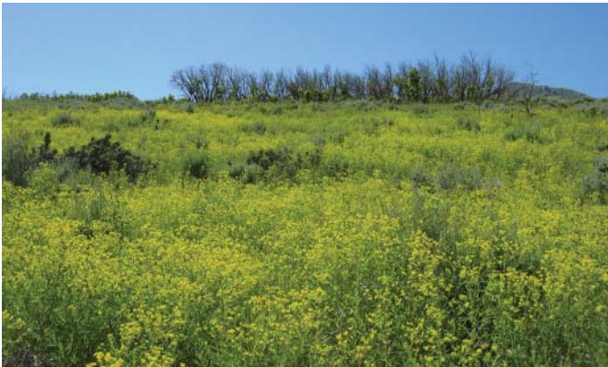
Leafy spurge can become quickly established in undisturbed areas.

Reproduction of leafy spurge will occur vigorously from both roots and numerous seed heads. Roots have been found to grow more than 10 feet vertically and horizontally, any part of which can regenerate a new plant. Seeds are enclosed in capsules which ultimately burst and disperse up to 15 feet in all directions. Most seeds will germinate within a year; however, they may last in the soil for up to 8 years. Seeds also float easily and therefore spread rapidly by water. Leafy spurge will colonize and reproduce on nearly all sites but prefers dry sites with a coarse soil; even heavily shaded woodlands are prone to infestation. Invasion into undisturbed areas is not uncommon, making it difficult to protect the land from new invasions.