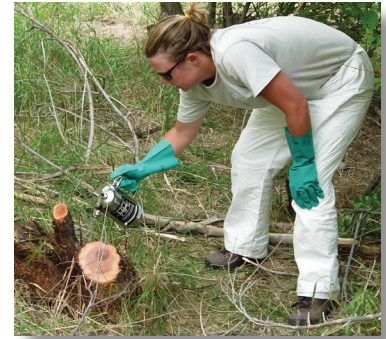
Applying herbicide to a cut tamarisk stump in the Jones Hole Creek watershed (above). Weed Warrior volunteers remove tamarisk from a river camp on the Yampa River (left).