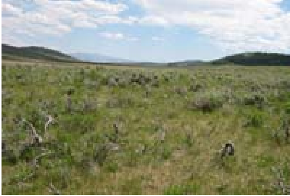
Figure 1. Area treated with 2,4-D in 1995.