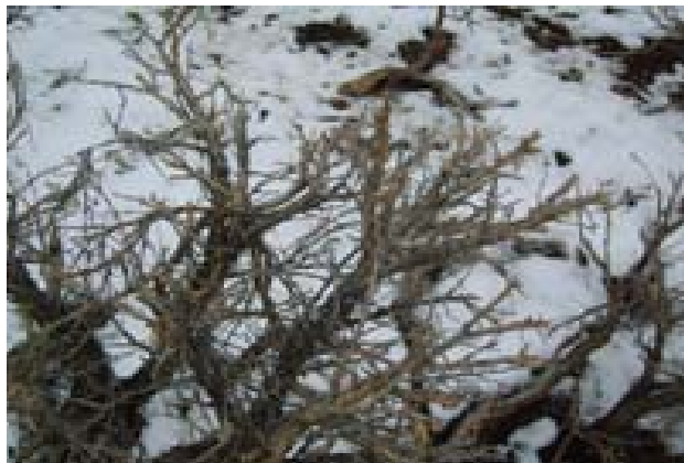
Figure 4. Heavily grazed sagebrush plant, Parker Mountain Study Site, 2006.