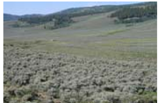
Figure 5. Area treated with Dixie Harrow in 2000.