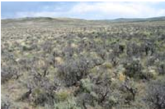
Figure 2. Area treated with Spike in 1994.