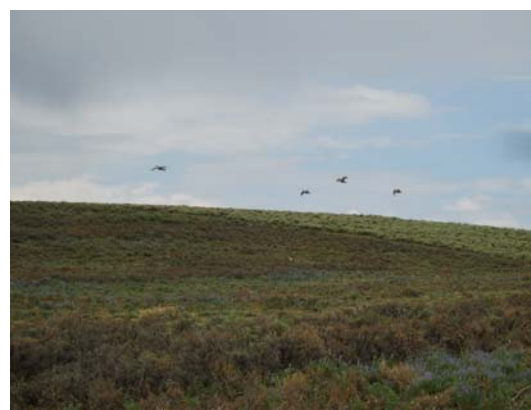
Figure 6. Greater sage-grouse brood flushing from a grazed sagebrush plot (center of photograph), Parker Mountain Study site, 2007