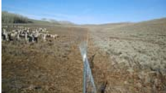
Figure 3. Grazed plot (left) and ungrazed plot (right), Parker Mountain Study Site, 2006.

Amount funded over 3 years: $141,124 Status: On-going