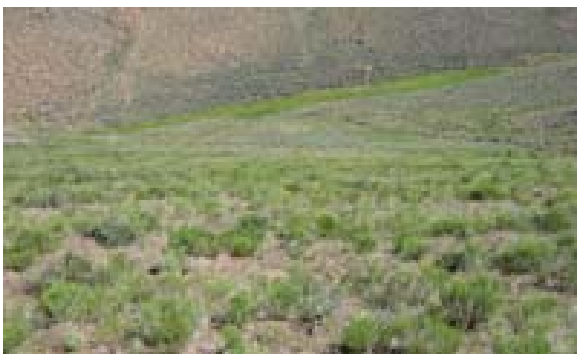
Figure 3. Area treated with fire in 2000.