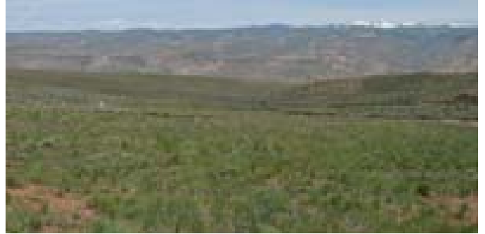
Figure 4. Area treated by brushmowing in 2003.