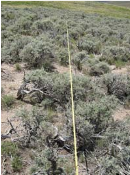
Figure 6. Line-intercept method measures shrub canopy cover.