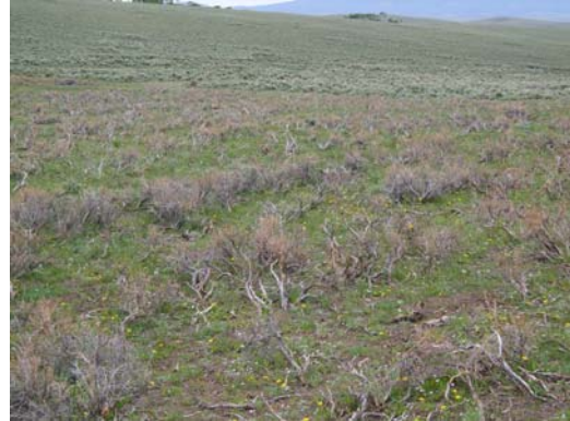
Figure 5. Sagebrush plot (center of photograph) in the spring, Parker Mountain Study Site, 2007.