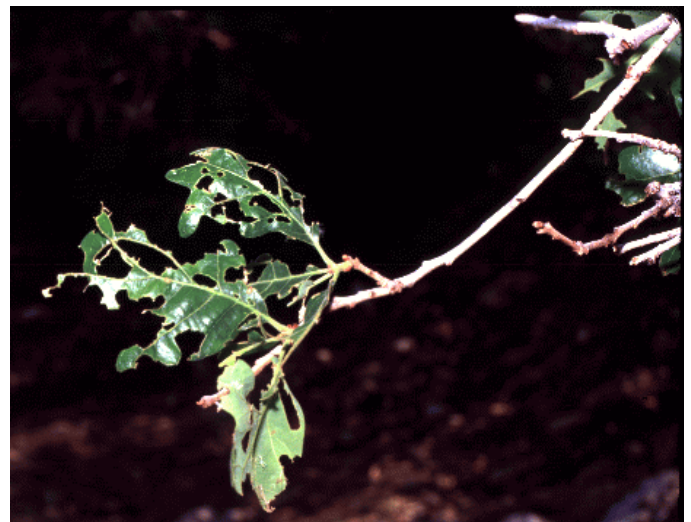
Cankerworm damage to oak