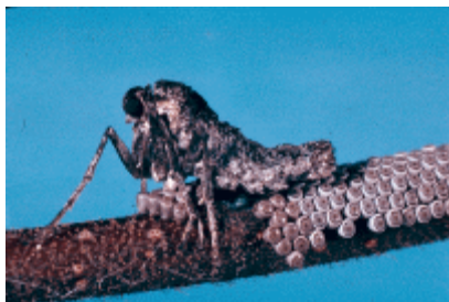
Adult female cankerworm laying eggs.

Cicadas are a large winged insect that produce a clicking noise. They can appear in great numbers for 4-6 weeks in June and July. They do not feed on leaves but can cause damage from egg laying wounds to the bark. The injury results in deep gouges that weakens small twigs, causing them to break in the wind. There are several species of cicada in Utah but the famous "17- year locust" is not present.