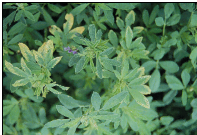
Figure 2. Potassium deficiency in alfalfa: browning and spots on leaf margins and tips.

Micronutrients. Deficiencies of zinc, iron, copper, manganese, and boron are rare in alfalfa. Soil testing can be used to determine if these micronutrients are needed (Table 4). If