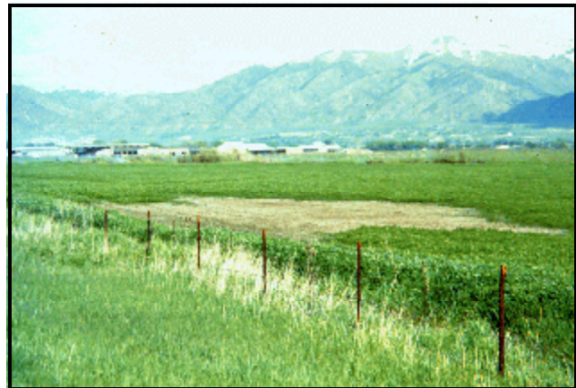
Figure 4. Depression in a field where alfalfa died out due to prolonged saturated soil conditions.

Drainage. Alfalfa will not survive prolonged periods with a saturated root zone. Fine textured soils, and fields with low areas where excess water collects (Figure 4), may be poorly drained and limit alfalfa growth. Improve drainage in these situations by deep tilling or ripping and leveling prior to establishing alfalfa.