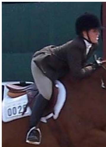
Two point position

The jumper course, unlike the hunter course, requires sharp turns, combinations and multiple changes of direction. Due to the greater degree of difficulty, more agility and athleticism are required from the horse and rider. The difficulty of the course and obstacles should be in direct relationship to the level of the competition. Each course will include 6 to 10 jumping efforts. The judge will blow a whistle to indicate the rider can begin the course. The exhibitor must salute the judge and be acknowledged before crossing the start line.