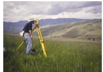
NRCS employees provide technical assistance to clients to help them plan and install conservation practices to their land (above, Photo: Rich Gribble).

Although research clearly indicates that sage-grouse are dependent on large expanses of