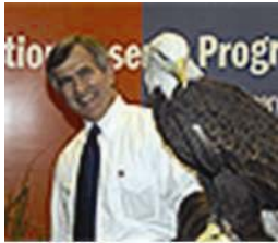
Agriculture Secretary Mike Johanns with Patriot the American Bald Eagle at the White House Conference on Cooperative Conservation.