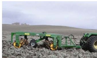
SGRP will evaluate the use of conservation practices, including brush management, to manage sage-grouse habitat.