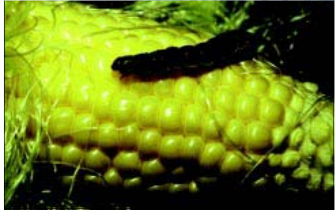
Larva on corn ear