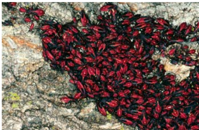
Fig. 1. Mass grouping of immature boxelder bugs 3

Boxelder bugs can feed and develop on many different kinds of plants, including maple, ash, stonefruits (cherry, plum, peach), apple, grape, strawberry and grass. However, large numbers are typically found on female boxelder trees where nymphs and adults feed on developing seeds (Fig. 1). Boxelder bugs are not usually found on ornamental plants, but have been known to damage fruiting trees during the late summer. Homeowners do not necessarily have to have a boxelder tree to notice adults around the home because they are mobile insects.