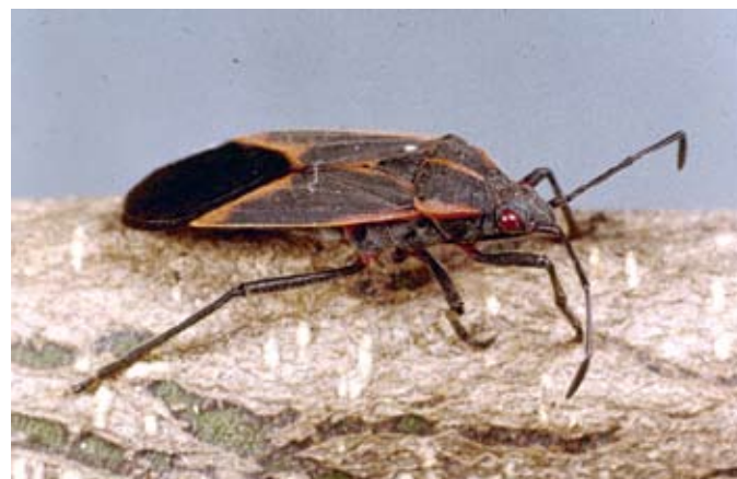
Fig. 2. Adult boxelder bug 1