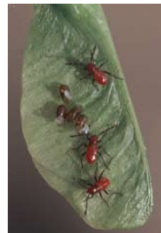
Fig. 3. Boxelder bug eggs and nymphs 2

The immature nymphs are wingless, but otherwise generally resemble the adults. When first hatched, small nymphs are completely red and sparsely covered with short, bristly hairs (Fig. 3). Slate-colored or black markings, particularly toward the head, appear when they are about half-grown. Large nymphs have obvious wing pads and black antennae and legs (Fig. 1).