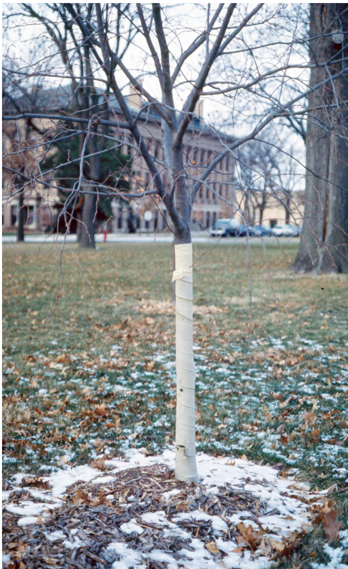
Paper Tree Wrap

of two to three winters after planting. Trunk and limb protection are less necessary as the bark thickens.