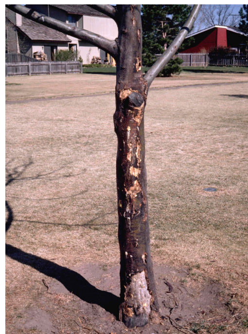
Honeylocust With Severe Sunscauld Damage area.

Damage from sunscauld injury can result in discolored bark, bark cracking, sunken areas from lack of growth, or sloughing of surface bark to reveal dead tissue within the damaged area.