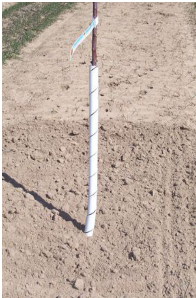
Plastic Tree Wrap

Sunscald injury as defined here is not possible in Utah in summer because all live tissues are metabolically active and temperatures below freezing are rare. However, some trees show sunscald-like injury in the summer. Norway maple, for example, is known for developing extensive wounding around summer pruning wounds and in portions of the crown exposed to the sun by pruning in summer. Though this damage is probably due to excessive heat or tissue drying, it can be countered in the same way. Avoid opening up crowns in summer by pruning more lightly or