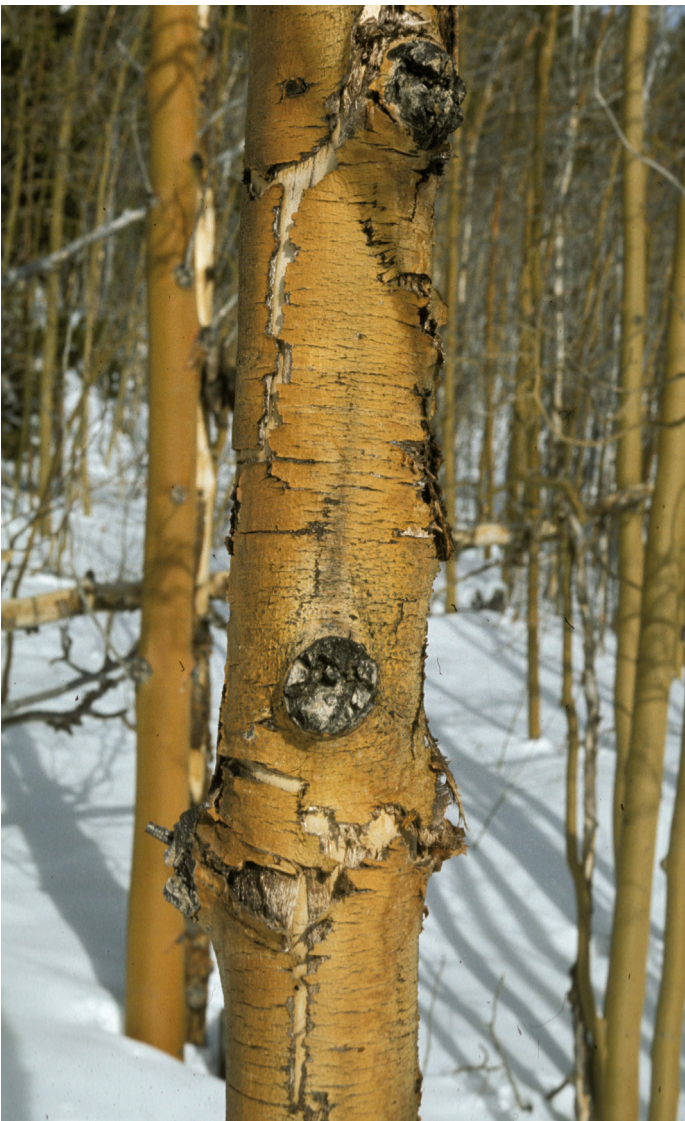
Sunscald Damage on Quaking Aspen

Sunscald or southwest injury refers to damage incurred though the killing of active cells within the trunk and limbs of sensitive trees during winter months. Young trees with thin bark are most susceptible to sunscald injury. The injury occurs when exposed bark on the tree warms up on sunny days and previously dormant cells within the plant become active in response to the warmth. Research has shown that the south side of a tree can be as much as 77°F warmer on a cold winter day than the north side of the tree. The newly activated cells lose some of their cold-hardiness and are injured when temperatures drop below freezing during the nighttime hours. Resulting damage includes discoloration and cracking