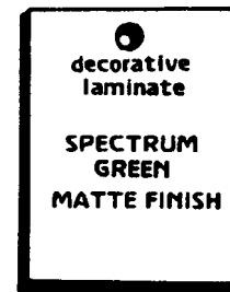
Figure 14.3. Plastic Laminate Labeling

On the back of a plastic laminate sample you will find the manufacturer's name, color, type of finish, and the order number for that particular plastic laminate (see Figure 14.3, Plastic Laminate Labeling). If the plastic laminate should be installed on only a vertical surface, the back of the sample will have the words "vertical grade only."