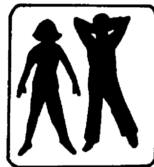
Figure 7.1. Mattress Size for Comfort

Another important consideration is the size of your bedroom and the number and size of other furnishings in your room. The easiest way to determine if the size mattress you want to purchase will fit into your bedroom is to measure the width and length of your bedroom. Put your bedroom measurements onto a piece of graph paper. A good size graph paper contains \frac{1}{4} -inch squares, each square equaling one foot. Make your bedroom furniture cutouts and planned bed size the same scale as the graph paper and place them into your bedroom drawing. For the mattress to fit into the room, allow twenty-two inches clearance at the sides of the mattress so you can