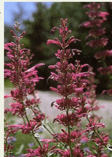
Hyssop/Agastache ( Agastache cana )