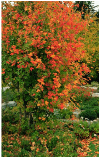
Bigtooth Maple ( Acer grandidentatum )

In order to better market the water wise plants available in many Utah nurseries and garden centers, and to assist consumers in identifying these plants, a program to recognize desirable low water use species has been developed. Representatives from Utah State University Extension, Utah State University Center for Water Efficient Landscaping, the Utah Nursery and Landscape Association, Utah Division of Water Resources, Utah Botanical Center, Jordan Valley Water Conservancy District, Red Butte Gardens, U.S. Bureau of Reclamation, Salt Lake City Corporation, Sandy City, and the Utah Native Plant Society have worked together to organize a water wise list of ornamental trees, shrubs, herbaceous perennials, ornamental grasses, and ground covers. The plants on the list are (1) water conserving, (2) adapted to Utah's arid climate and cold winters, (3) available in the industry, (4) relatively easy to maintain in the landscape and (5) have desirable landscape characteristics which remain desirable under limited